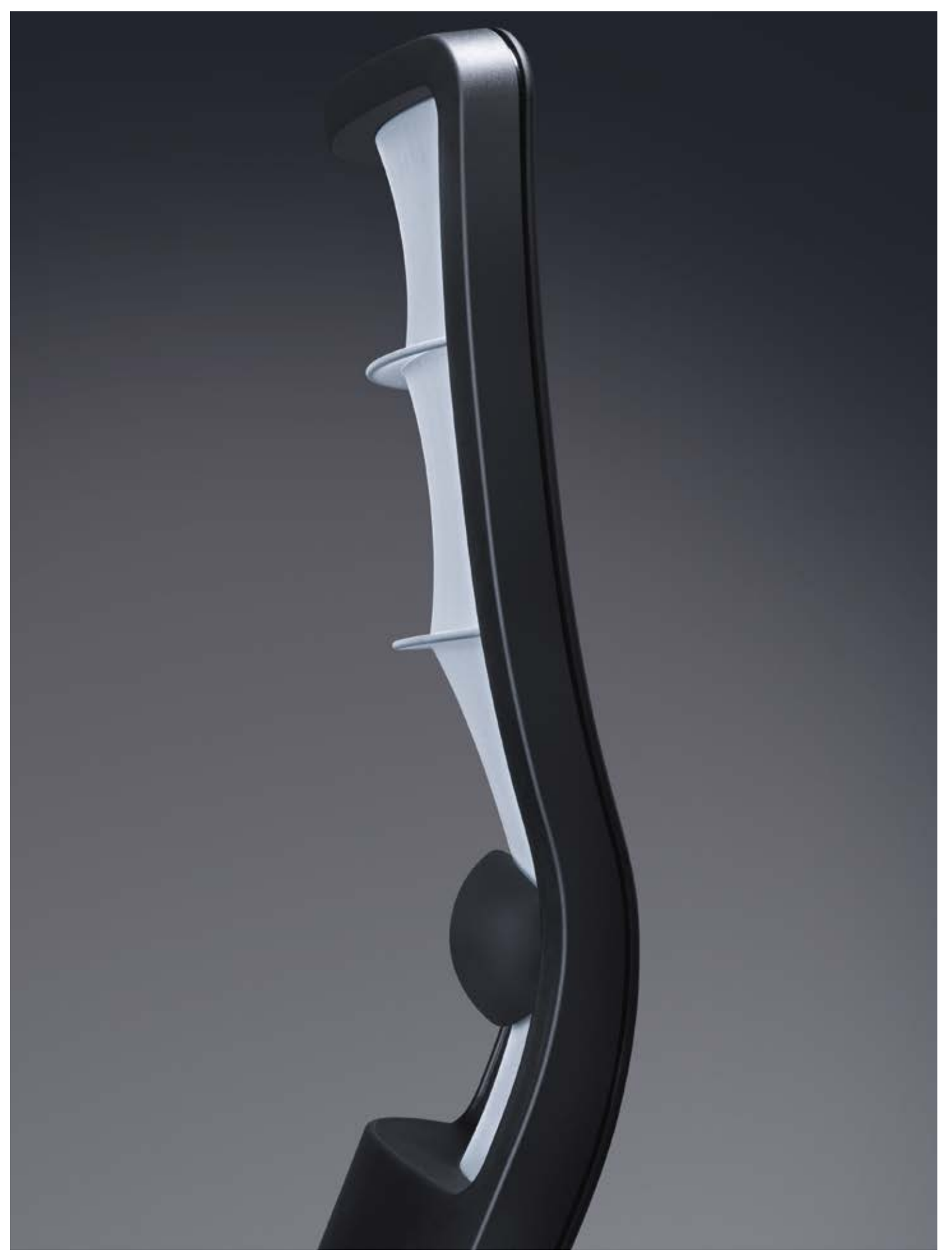
The backrest is segmented by means of fine bars. These are narrow yet highly stable. The membrane is stretched between the bars and generates a tremendously high level of freedom of movement and support for the back.